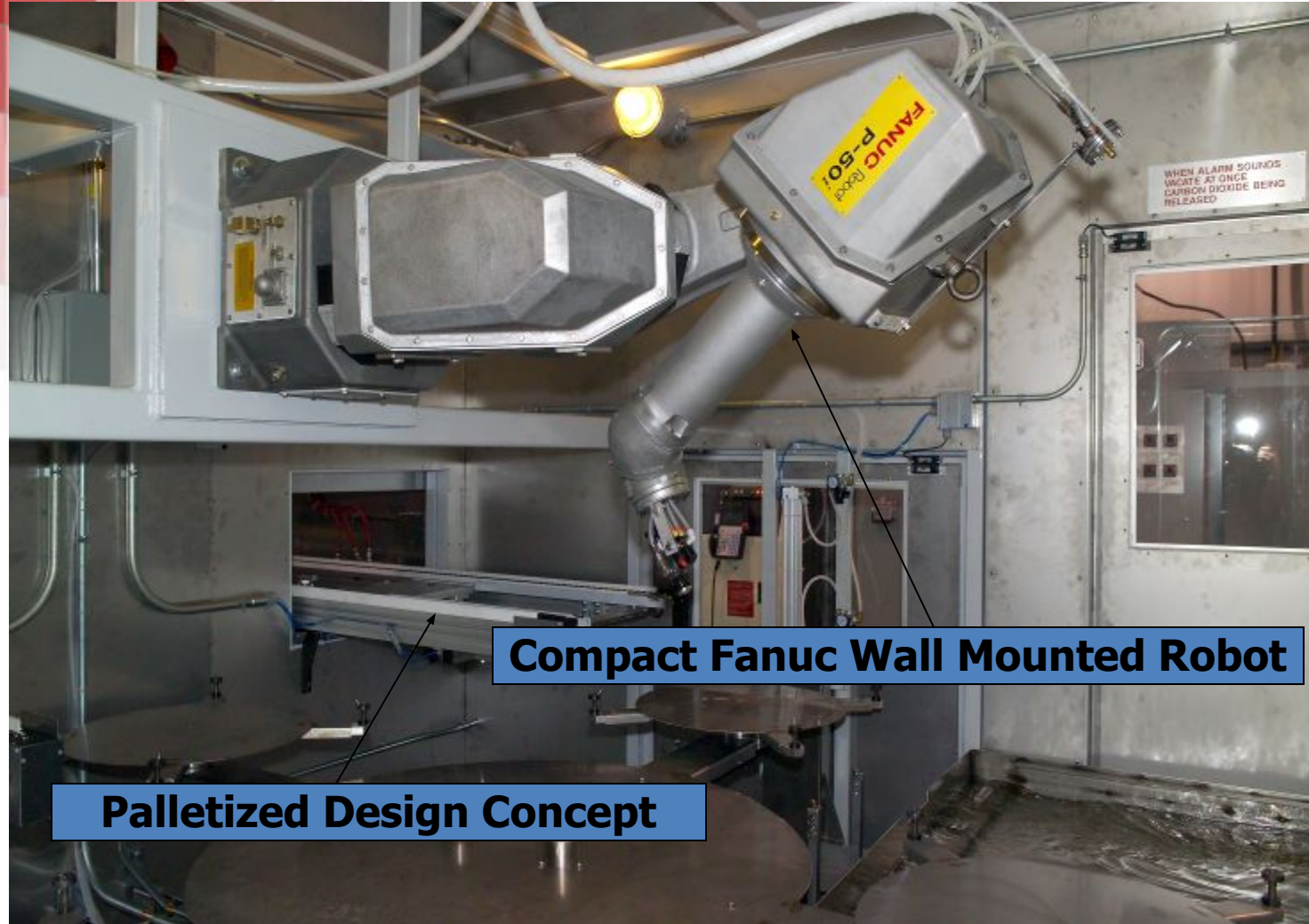
Compact Fanuc Wall Mounted Robot