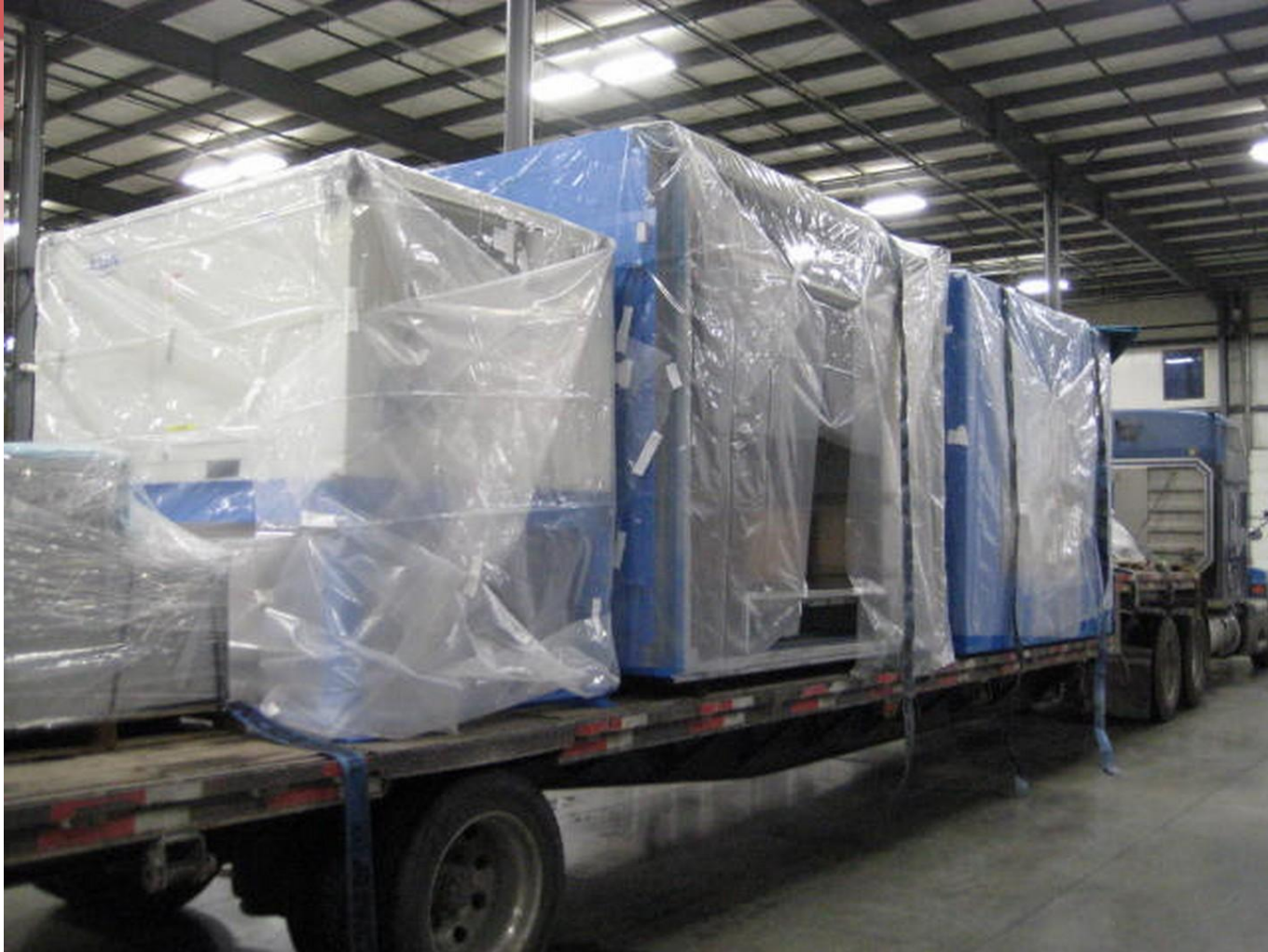
Modules Built to Fit Standard Flat Bed